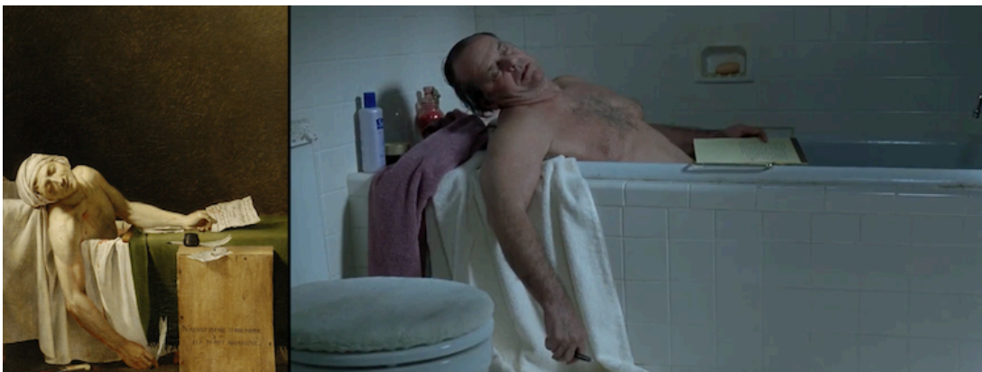
Jacques-Louis David, La mort de Marat (1793) and Alexander Payne, About Schmidt (2002)