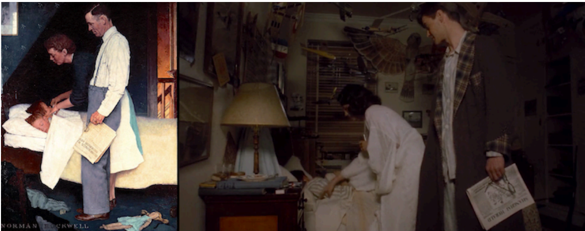
Norman Rockwell, Freedom from Fear (1943) and Steven Spielberg, Empire of the Sun (1987)