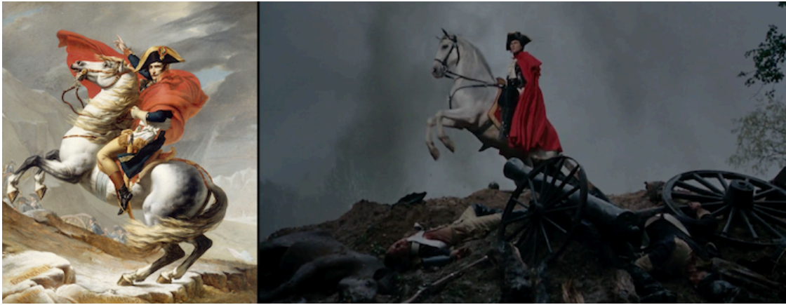
Jacques-Louis David, Napoleon Crossing the Alps (1801) and Sofia Coppola, Marie Antionette (2006)

Read the whole article on boredpanda: https://www.boredpanda.com/movie-vs-painting-copy-film-meets-art/