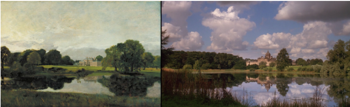
John Constable, Malvern Hall, Warwickshire (1809) and Stanley Kubrick, Barry Lyndon (1975)