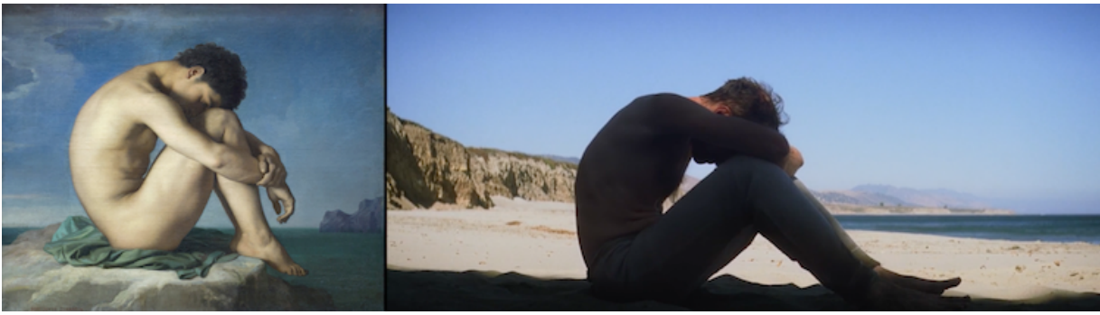
Jean-Hippolyte Flandrin, Jeune homme nu assis au bord de la mer (1836) and Paul Thomas Anderson, There Will Be Blood (2007)