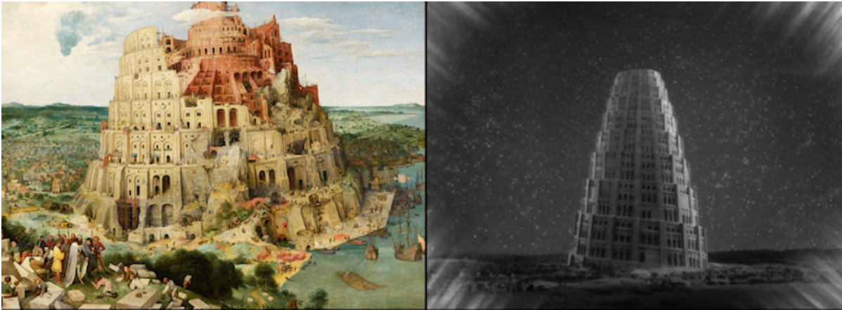
Pieter Bruegel the Elder, The Tower of Babel (1563) and Fritz Lang, Metropolis (1927)