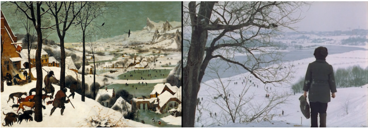
Pieter Bruegel the Elder, The Hunters in the Snow (1565) and Andrei Tarkovsky, The Mirror (1975)