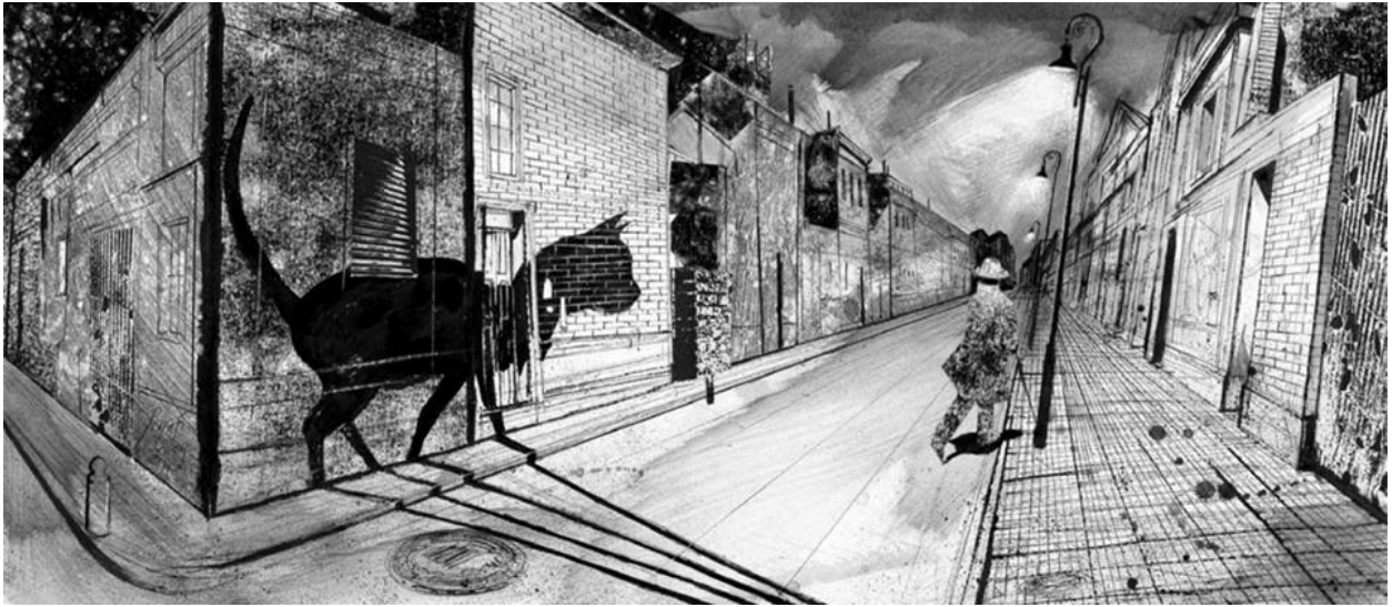
Image Luis Scafati , The Black Cat (Scafati illustrated the short story of Poe), translated in many languages

been alarmed at the violence of my previous anger, and forebore to present itself in my present mood. It is impossible to describe, or to imagine, the deep, the blissful sense of relief which the absence of the detested creature occasioned in my bosom. It did not make its appearance during the night -- and thus for one night at least, since its introduction into the house, I soundly and tranquilly slept; aye, slept even with the burden of murder upon my soul!